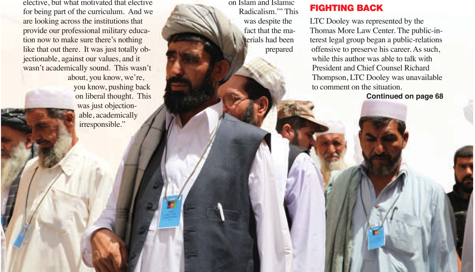
Participants in the Moderate Voices of Islam Initiative prepare to go to the Jordanian Mosque at Forward Operating Base Shank, Logar Province, Afghanistan. The participants from Logar and Wardak provinces will then travel to Amman, Jordan and Mecca, Saudi Arabia. A presentation discussing Islam at the Joint Forces Staff College raised controversy over its depiction of Islam.